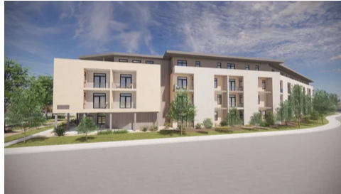
Plaza Luna Lofts Spire Development & NewLife Homes, Inc. Desert Hope Apartments Phase II Mesilla Valley Housing Development LLC

At its May board of directors meeting, Housing New Mexico approved Low-Income Housing Tax Credits (LIHTC) for housing developments statewide. These developments were selected under a highly competitive process and in compliance with the Qualified Allocation Plan. In addition to the LIHTC awards, Housing New Mexico made gap financing awards from the National Housing Trust Fund (NHTF), HOME Investment Partnership (HOME), and New Mexico Housing Trust Fund (NMHTF). This process takes many months of work from both the applicants and Housing New Mexico staff.