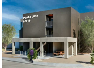
Plaza Luna Lofts LIHTC, HOME & NMHTF Total Award: $5.2 Million

Plaza Luna Lofts will be a 57-unit multifamily development serving senior households in Los Lunas. The project will consist of 46 one-bedroom units, each at approximately 642 square feet and 11 two-bedroom units, each at approximately 810 square feet. The development team has prioritized sustainability and efficiency in the project's design with low-flow plumbing fixtures and drought-resistant xeriscaping to minimize water usage.