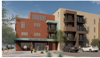
Villa de Tularosa Tierra Encantada San Mateo Manor Spire Development, Inc. Nueva Acequia Apartments TWG Development, LLC & Santa Fe County